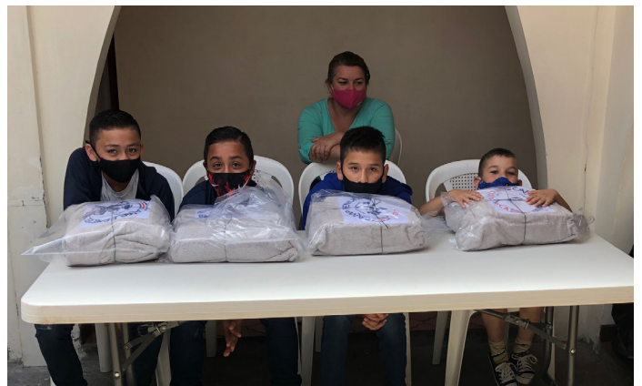
4 happy boys with their leader as they receive their packets!

This group of leaders in an Esparza barrio is displaying the dragonfly card which was explained by Paul. They will use these cards for grieving families in their area. The card is designed on an 8 1/2 by 11" sheet of paper which will be folded into card size. The card explains the dragonfly story and a message from Camp Penuel Costa Rica.